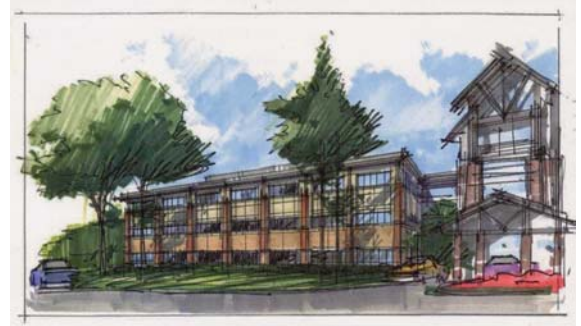
New Parker Office Professional Building

Look for information about our grand opening in Spring 2004!